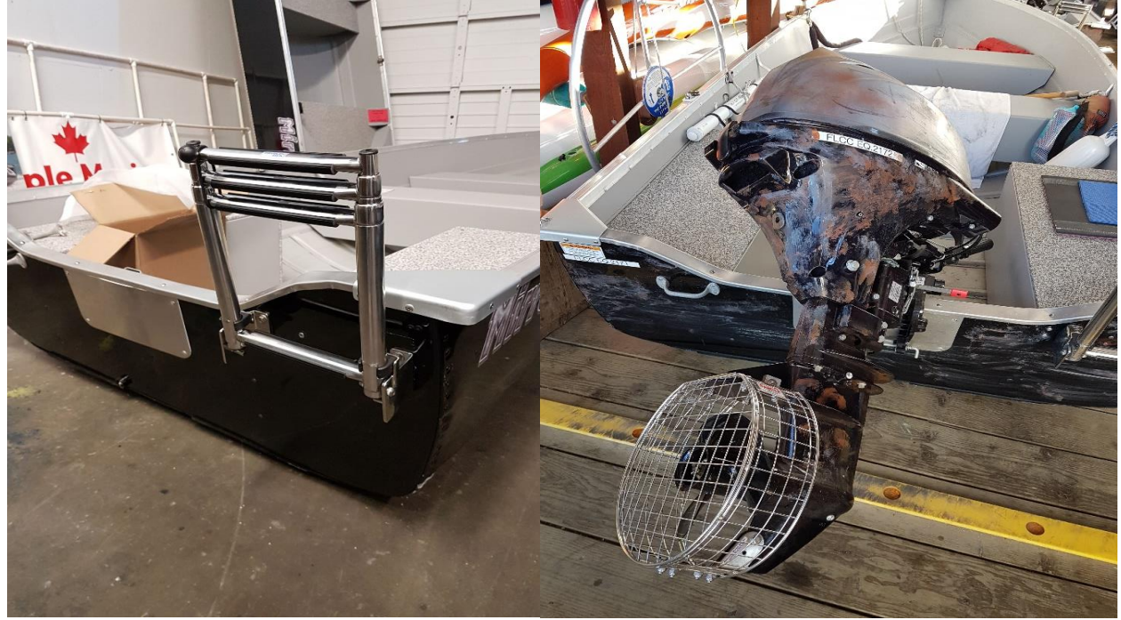
Telescoping Safety Ladder at Transom

3. SAFETY NOTE: when performing a rescue from water, shut motor OFF until person is safely in the boat. A Safety Ladder is attached to the transom for rescue from the water. The ladder is a 4-step telescoping ladder designed to allow for boarding at transom. During retrieval, the boat motor is to be turned off, operator to move to the bow of the boat to counter balance the weight.