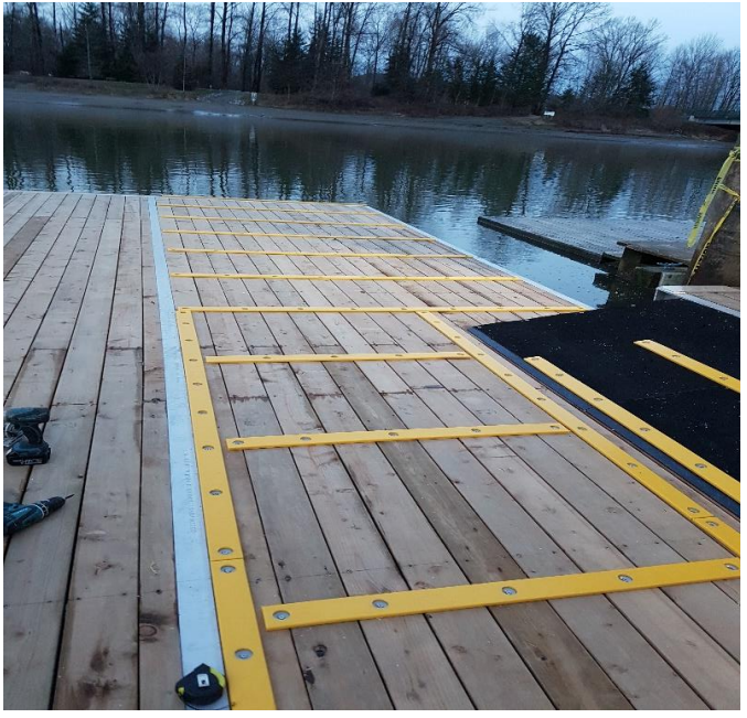
Dock Platform & Yellow Strips